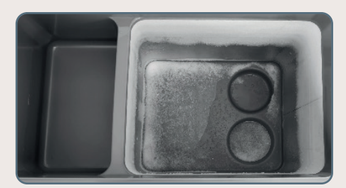
Fridge/freezer dual zone