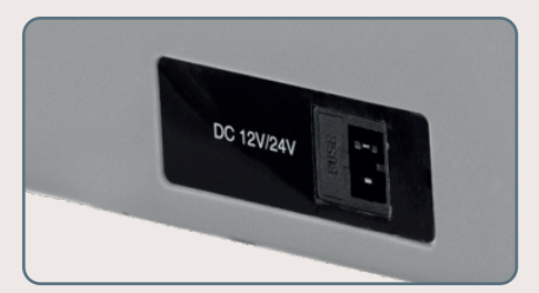
AC/DC dual use