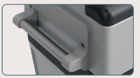
Heavy duty handle